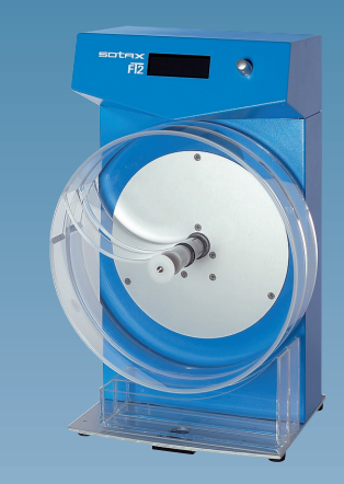
FT 2 with two drums